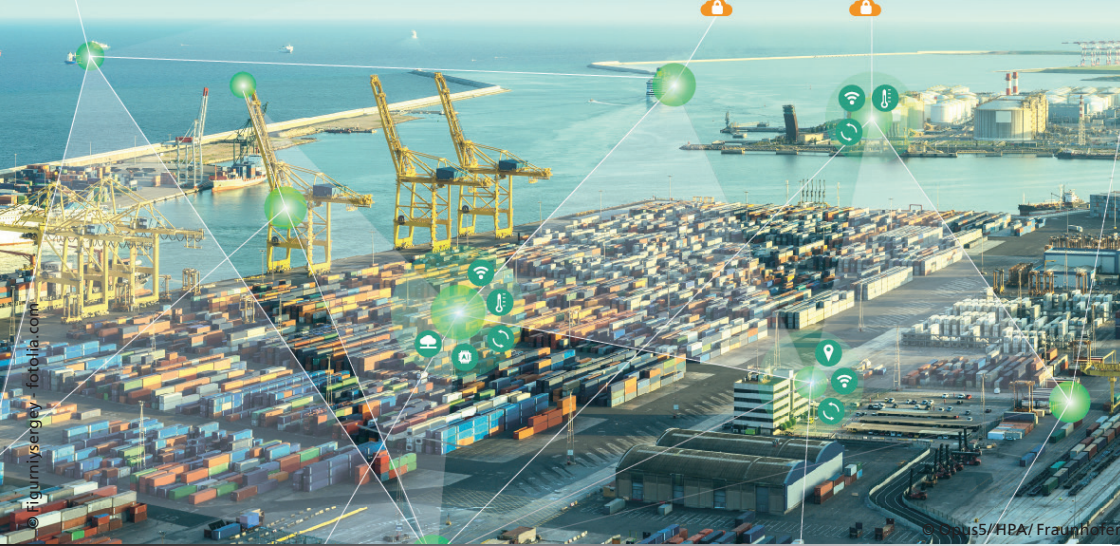
The Internet of Things enables self-controlling processes in ports